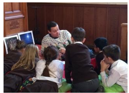
P6 pupils listening to the Christmas story at a Christmas Unwrapped

With the local churches, we have several supported residential events. It's great to see young people whom we've known for several years really flourish at these events, having a safe space to talk through problems and discover they are capable of more than they realised. We have also been part of holiday clubs that the churches run in the local communities, where crafts, fun, bible stories and games all help children to develop and feel valued.